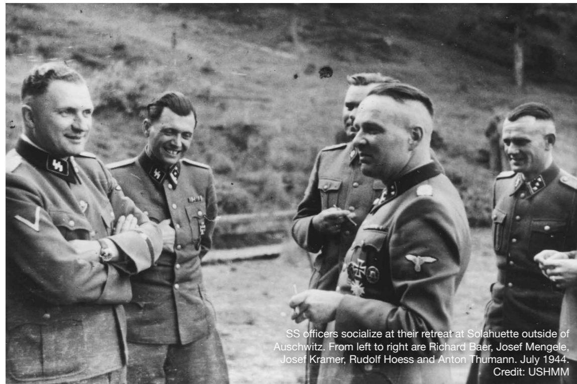
SS officers socialize at their retreat at Solahuette outside of Auschwitz. From left to right are Richard Baer, Josef Mengele, Josef Kramer, Rudolf Hoess and Anton Thumann. July 1944.