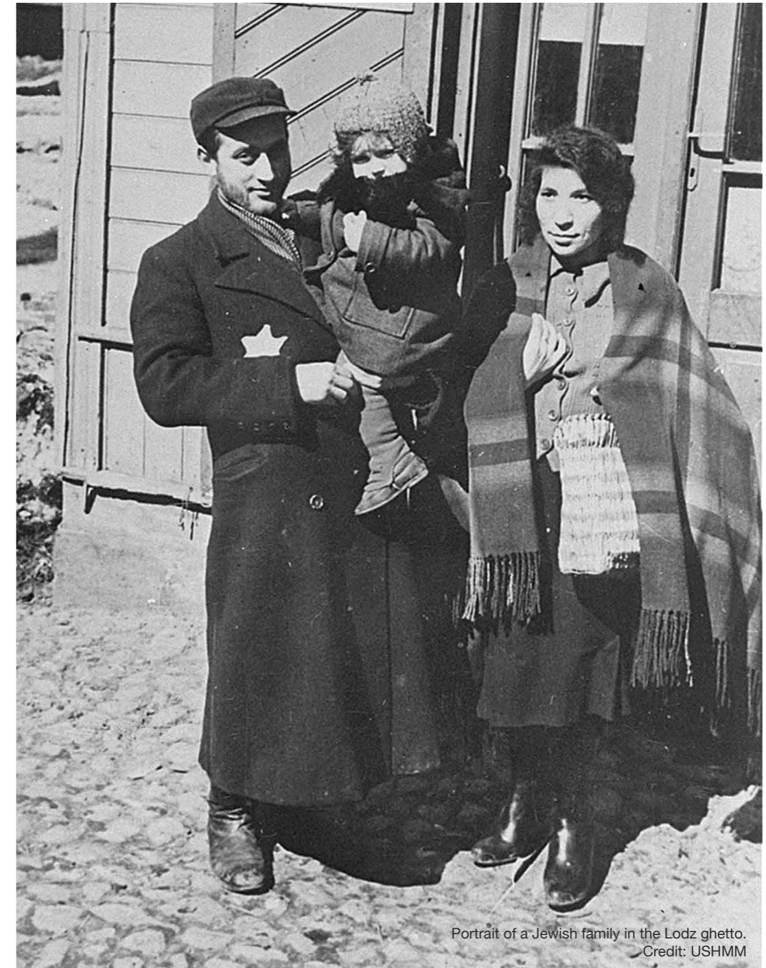
Portrait of a Jewish family in the Lodz ghetto.

In general, the study found that students had a very limited knowledge of the context and wider socioeconomic and political conditions which enabled the Holocaust to unfold in the manner that it did. Only a limited number of students tried to explain the Holocaust by looking at its immediate historical context and these explanations were mainly framed with reference to Germany’s economic downturn and the loss of the First World War.